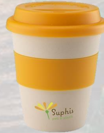
Eco Bamboo Mug-to-go Cup – Equip students with the perfect eco cup to ensure they get enough coffee to keep them awake.