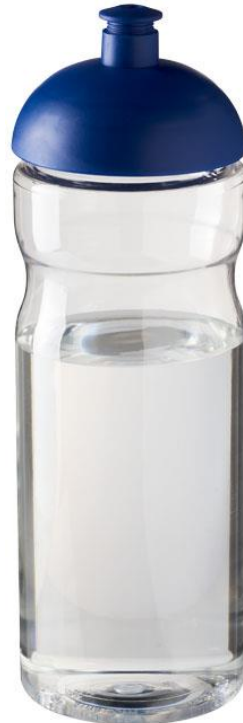
H2O Base – Dome Lid Sports Bottle 650ml