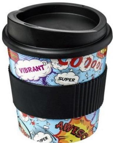
Americano Primo 250ml