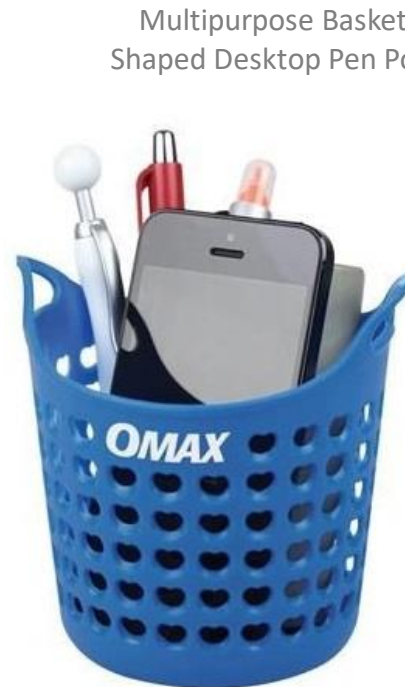
Multipurpose Basket Shaped Desktop Pen Pot.