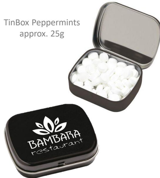
TinBox Peppermints approx. 25g