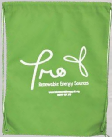
Eco-friendly Drawstring Bag – Made from non-woven Polypropylene this bag is kind on the environment and available in a range of colours.

Eco-friendly products are becoming increasingly more popular as companies develop new ways to create sustainable products and ones that are kinder to our planet. Here are a few eco-friendly product ideas for students.