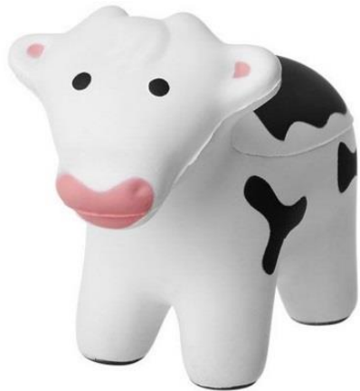
Fun Foam Stress Reliever

Reusable bottles are a valuable product for students that are on-the-go. Not only are they durable but they can also reduce the usage of one use plastic bottles.