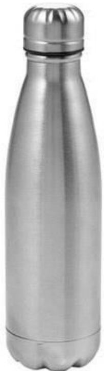
Double Walled Water Bottle 500ml

Reusable bottles are a valuable product for students that are on-the-go. Not only are they durable but they can also reduce the usage of one use plastic bottles.