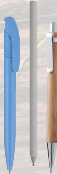
Eco-friendly Stationery – A wide range of eco-friendly pencils and pens are the perfect addition to the notebook.