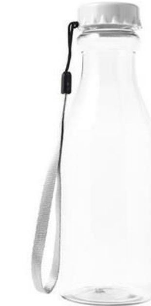
Plastic Water Bottle with Crown Cap and Carry Strap 530ml