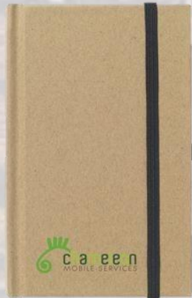
Pocket Eco A6 Notebook – This notebook is made of recycled material. The handy pen-loop and elastic closure ensure no student will lose their notes or pens.