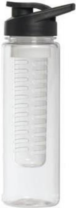
Drink Bottle with Removable Infuser 700ml