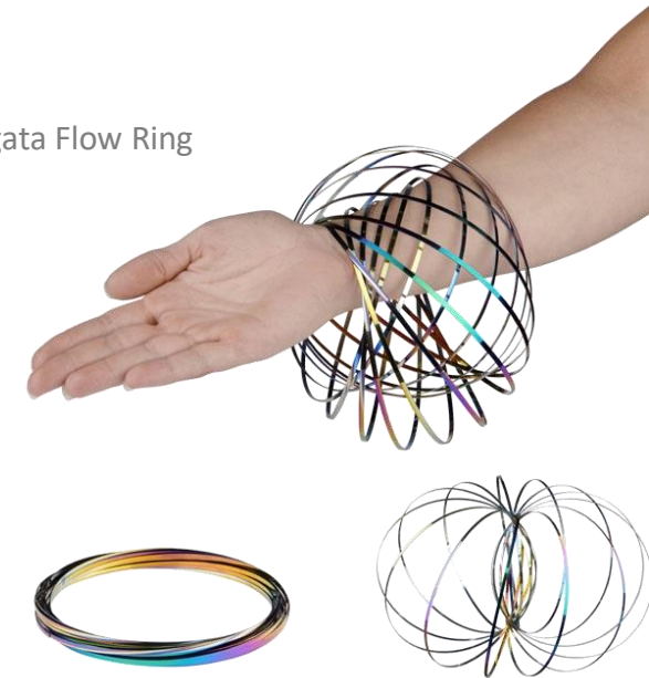
Agata Flow Ring

Check out our online catalogue for more products: https://merchandise.thesourcer.com/