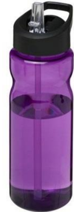
Sports bottle 650ml