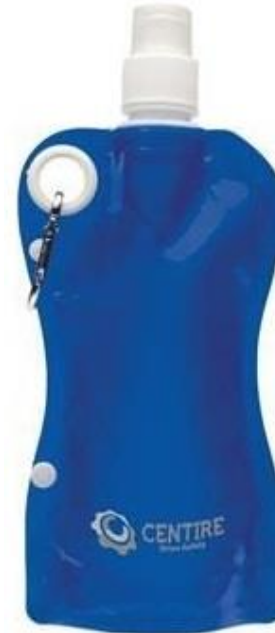
Flex Water Bottle – Folding Water Bottle with Sports Cap.