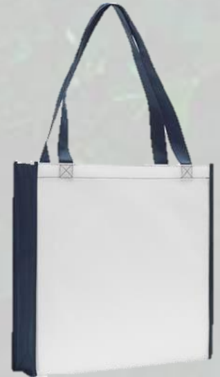
Rochester Tote Bag – Eco-friendly reusable tote shopper bag.